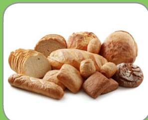
Rice, beans, pasta & bakery items