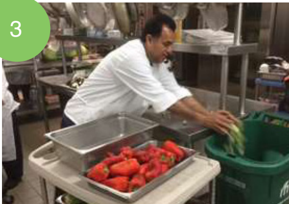
Totes are filled with food waste and swapped out as needed.