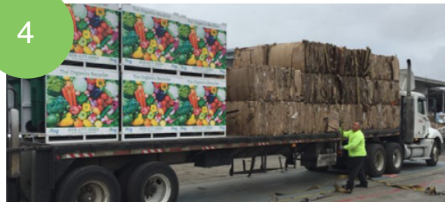
RMG will deliver and exchange PODS with its forklift equipped flatbed trucks. RMG can also pick up other recyclables materials such as baled cardboard and shrink-wrap during the same service if requested.