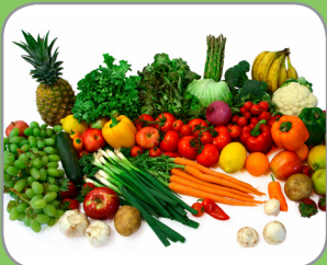
Fruits & Vegetables