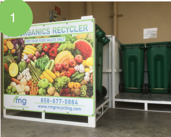
Each pod contains 4 (32 gal) totes.