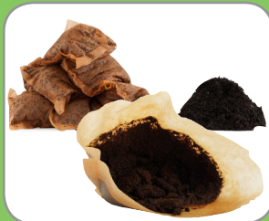
Coffee grounds, filters & tea bags