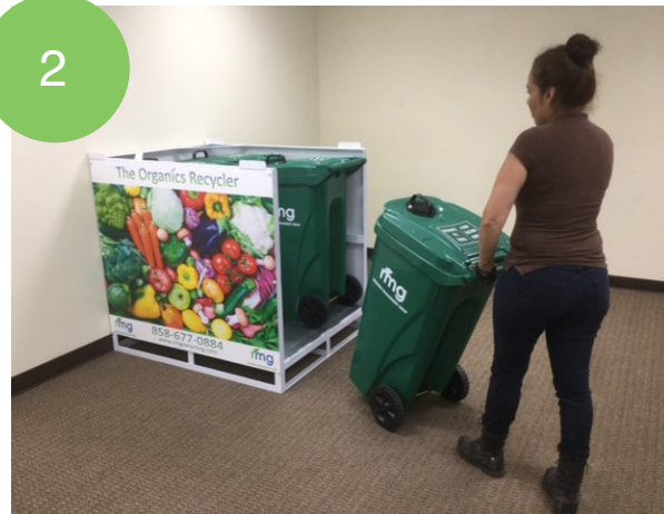
Customers wheel one tote to work station at a time.