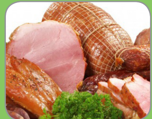
Boneless cooked meats